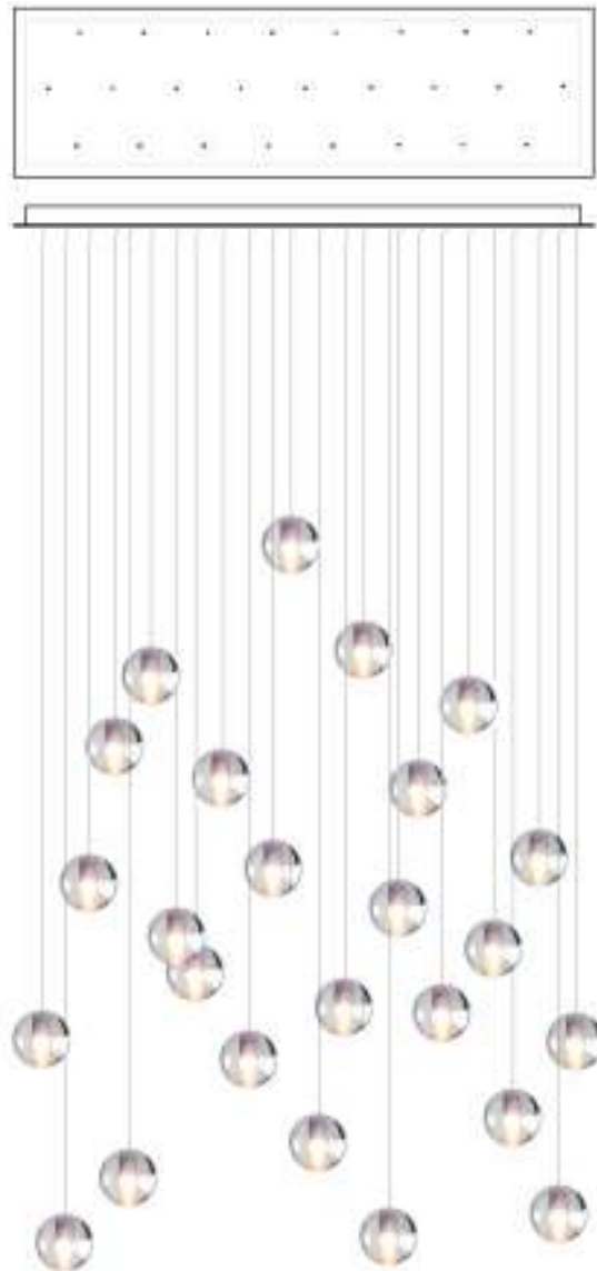
GLOBE LIGHTING - RBPL25