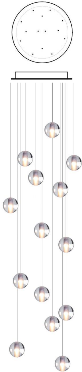
GLOBE LIGHTING - CBPL14