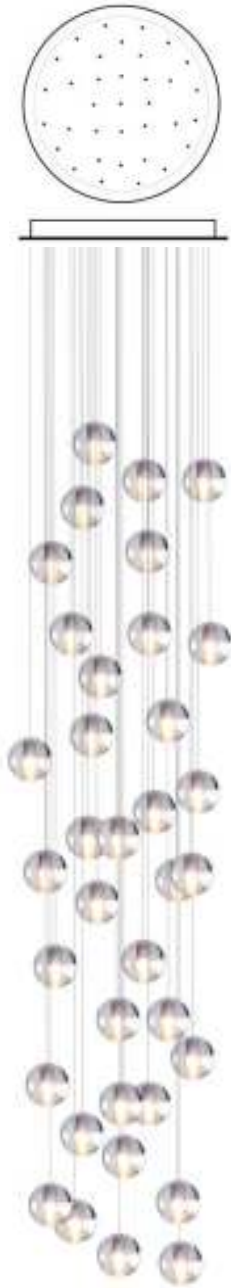
GLOBE LIGHTING - CBPL36